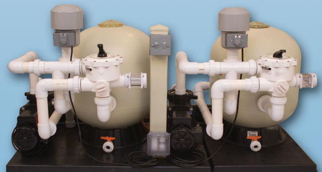
(Advantage 15,000 Gallon Plug and Play System)

-The Advantage Plug and Play System comes in several sizes for ponds ranging from 1,000 to 15,000 gallons.