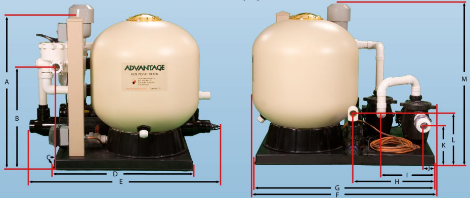
(Shown with Dual Pump Option)